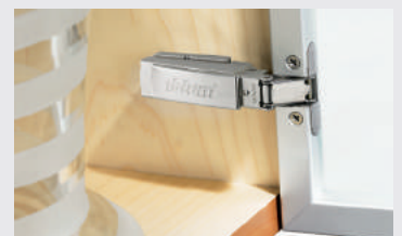
CLIP top hinges