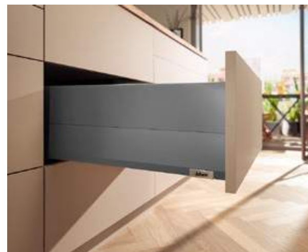
MERIVOBX modular with BOXCAP in orion grey matt