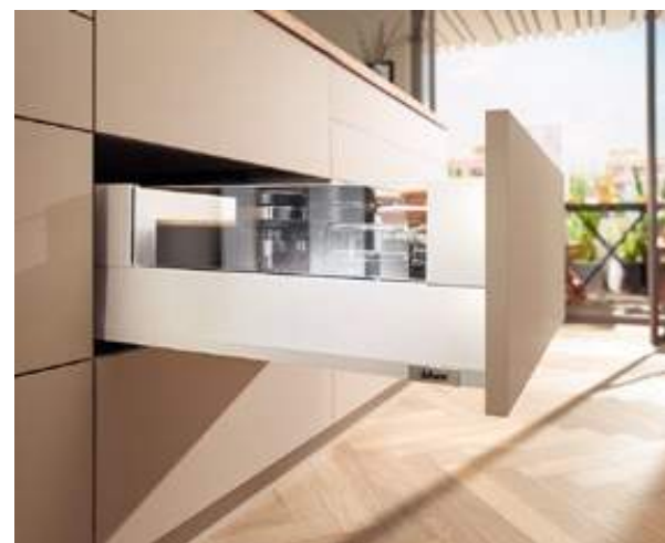
MERIVOBX modular with BOXCOVER in silk white matt