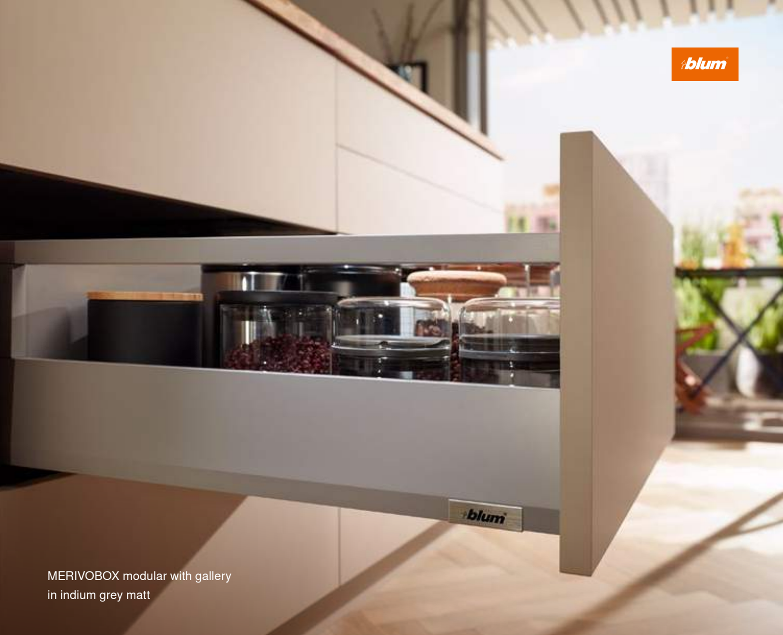
MERIVOBX modular with gallery in indium grey matt