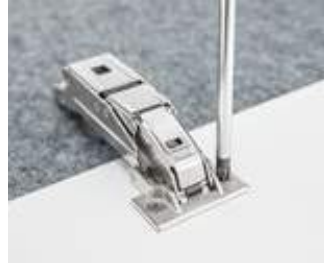
Tighten screws and it's done