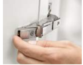
Easy assembly and removal due to CLIP technology