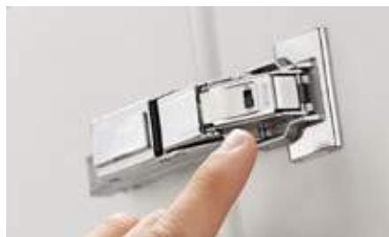
Switch for BLUMOTION deactivation