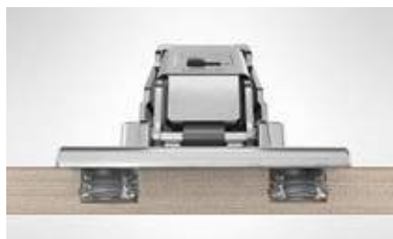
EXPANDO T – the innovative fixing system