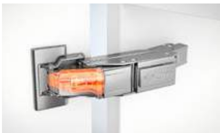
BLUMOTION is integrated into the hinge arm