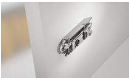
Attach the mounting plate in the standard position