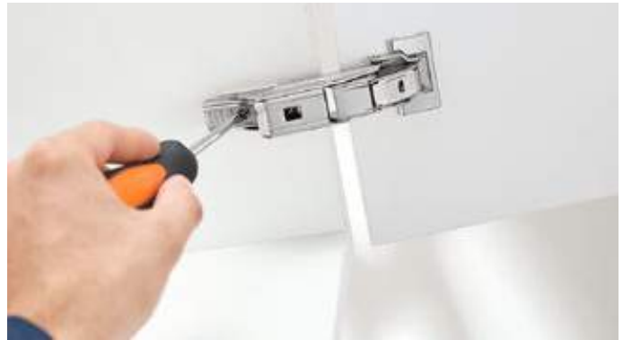
Usual straightforward 3-dimensional adjustment