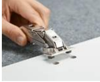
Place the dowels into the drilled holes