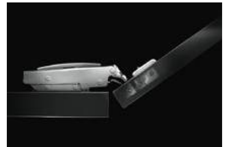
Small drilling depth of 11.5 mm for door thicknesses from 15 mm