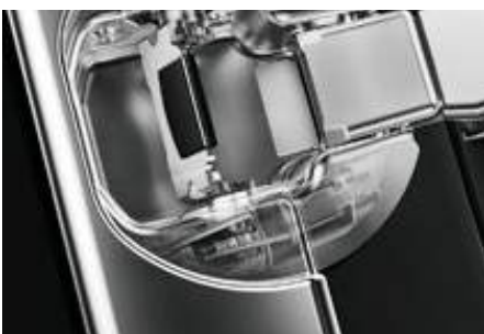
Soft-close mechanism seamlessly integrated into the hinge boss