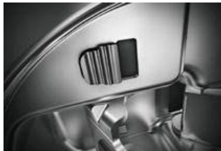
Switch for BLUMOTION deactivation