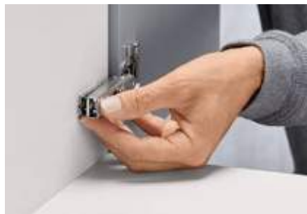
The CLIP assembly method is tool-free, quick and easy.