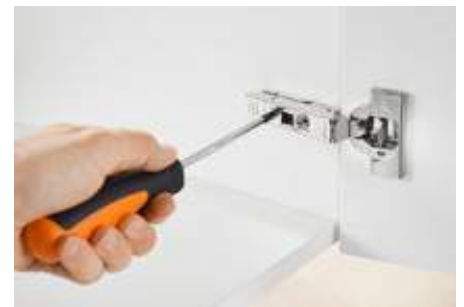
Convenient 3-dimensional adjustment for a harmonious gap layout.