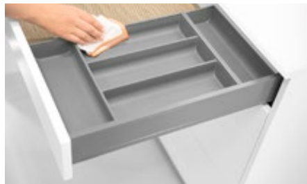
AMBIA-LINE cutlery insert in steel design