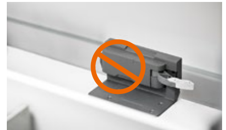
SERVO-DRIVE, the electric motion support system