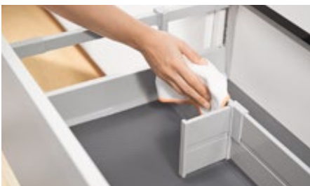
ORGA-LINE cross divider