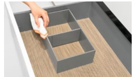
AMBIA-LINE frame, steel design