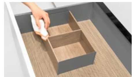
AMBIA-LINE frame, wood design