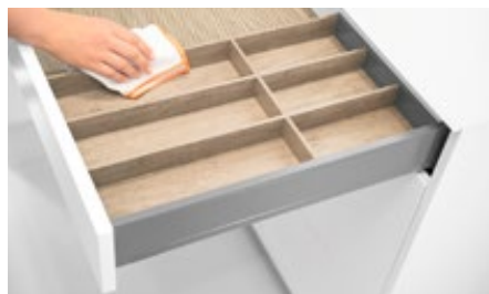
AMBIA-LINE cutlery insert in wood design