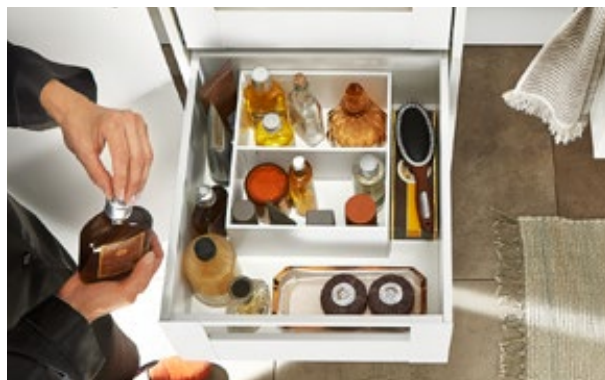
Toiletries in bathrooms are kept nice and tidy and are immediately to hand. SPACE TOWER equipped with LEGRABOX pure in silk white matt.